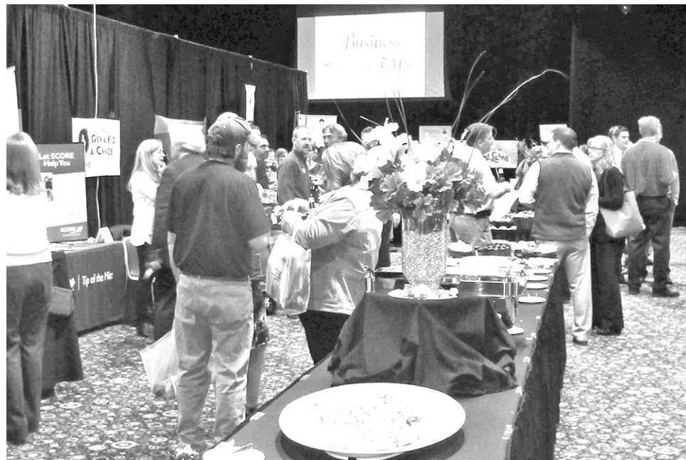
The Odawa Casino Resort's food service was among the many area eateries featured during this year's Business Expo "Taste of Petoskey", offering up what appeared to be endless tables lined with fresh fruits, cheeses and other delicious appetizers.

Nearly 600 people typically attend this exciting event. It is a unique opportunity to browse the products and services offered by a wide array of area businesses and organizations...all in one convenient location. Attendees also have a chance to win tons of fabulous door prizes from great businesses and organizations from across the area, as well as a chance to win visa gift cards supported by gold sponsors. This year's gold sponsors are Blue Cross, Blue Shield, Blue Care Network, Angel Heart Home Care, Odawa Casino,