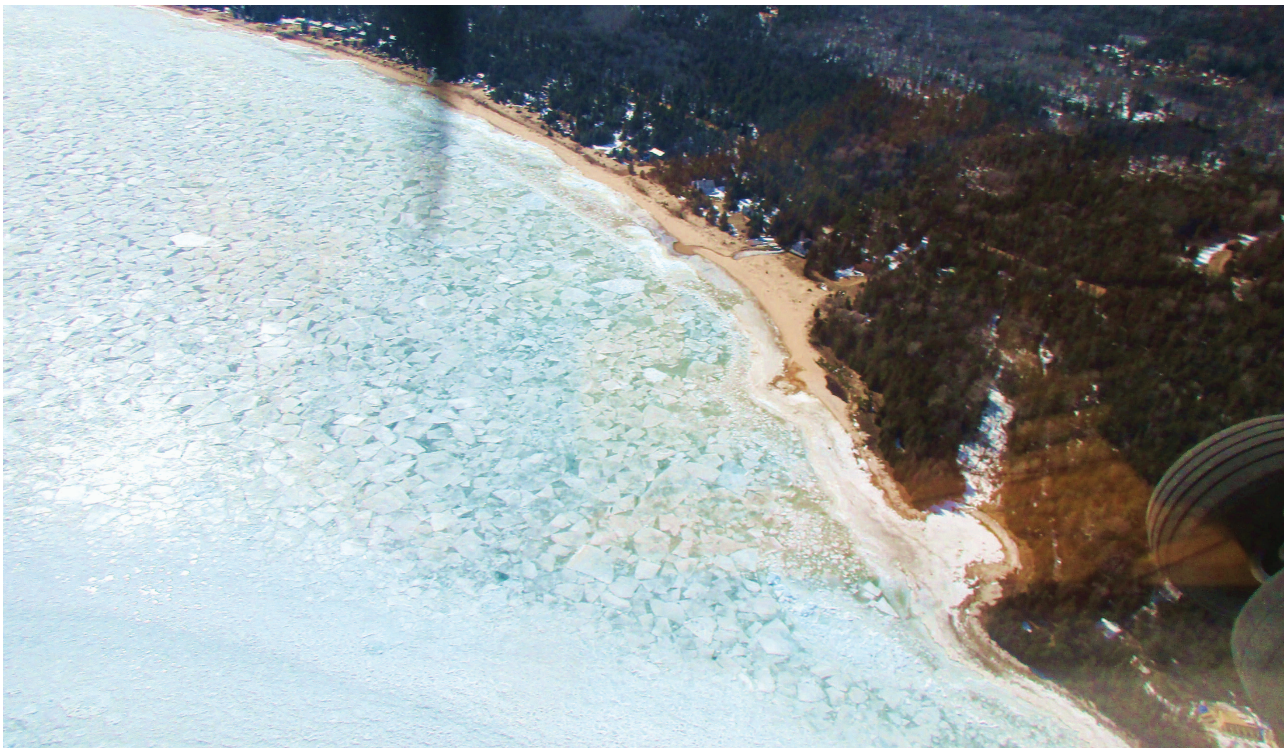
Fractured ice floes along the shores of Beaver Island are sure signs of spring and are making way for the Emerald Isle ferry when it embarks on its maiden voyage between the island and Charlevoix for the 2018 season on April 13th.