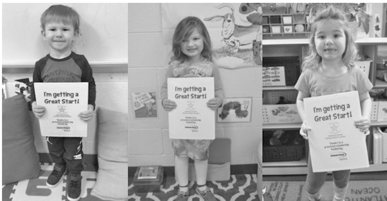
Scholarship recipients at preschool.